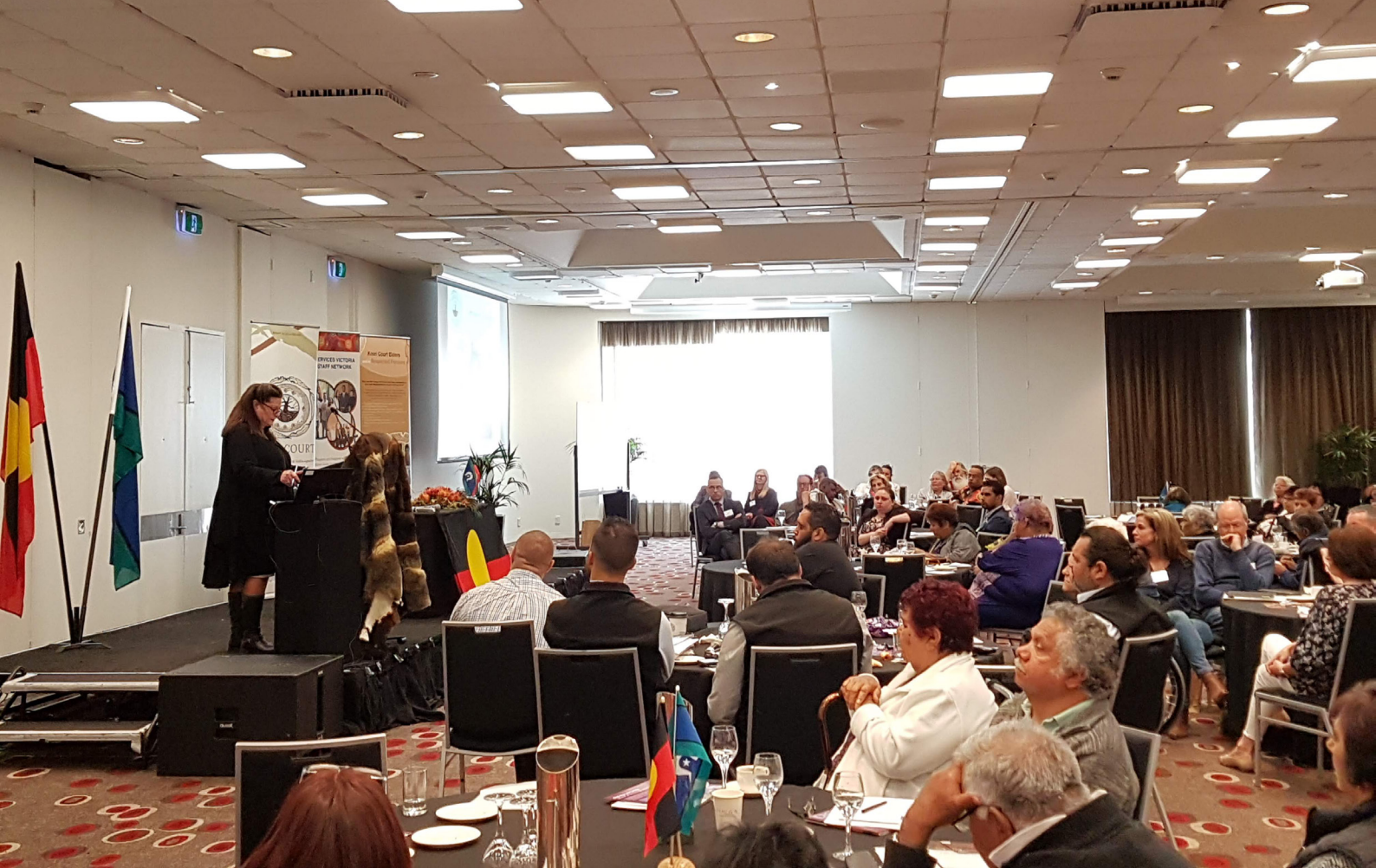
2018 Koori Court Conference, Melbourne, 26 October 2018